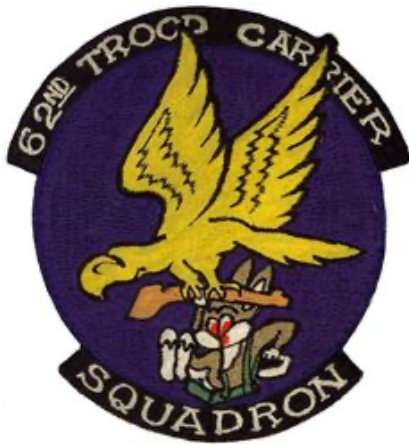
62 Troop Carrier Squadron